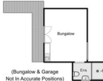
(Bungalow & Garage Not In Accurate Positions)