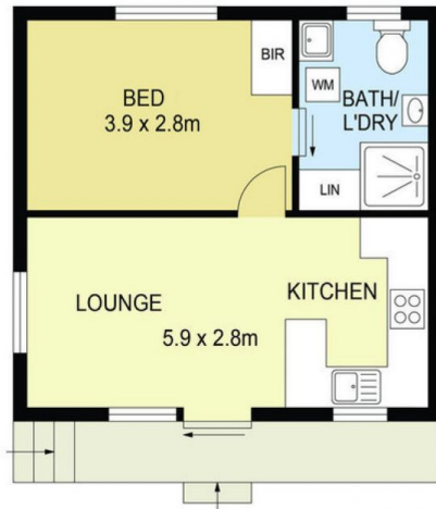
BUNGALOW (Not in position)