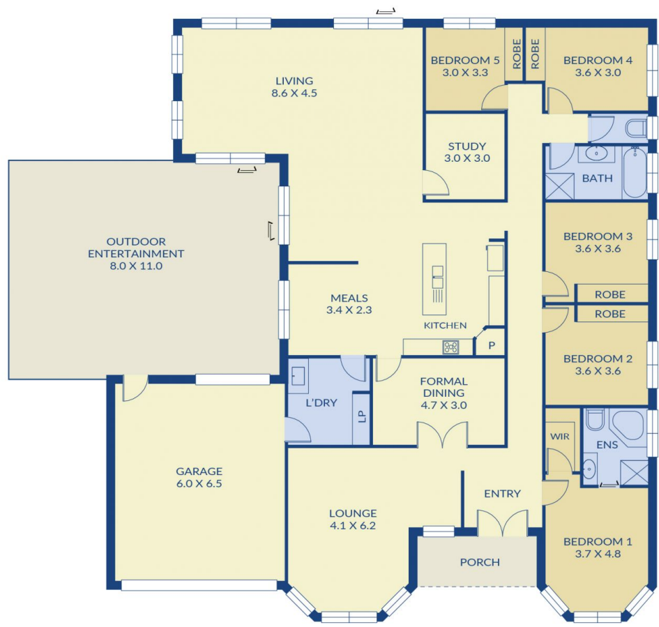
(NOT IN POSITION)