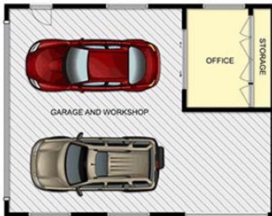
GARAGE AND WORKSHOP