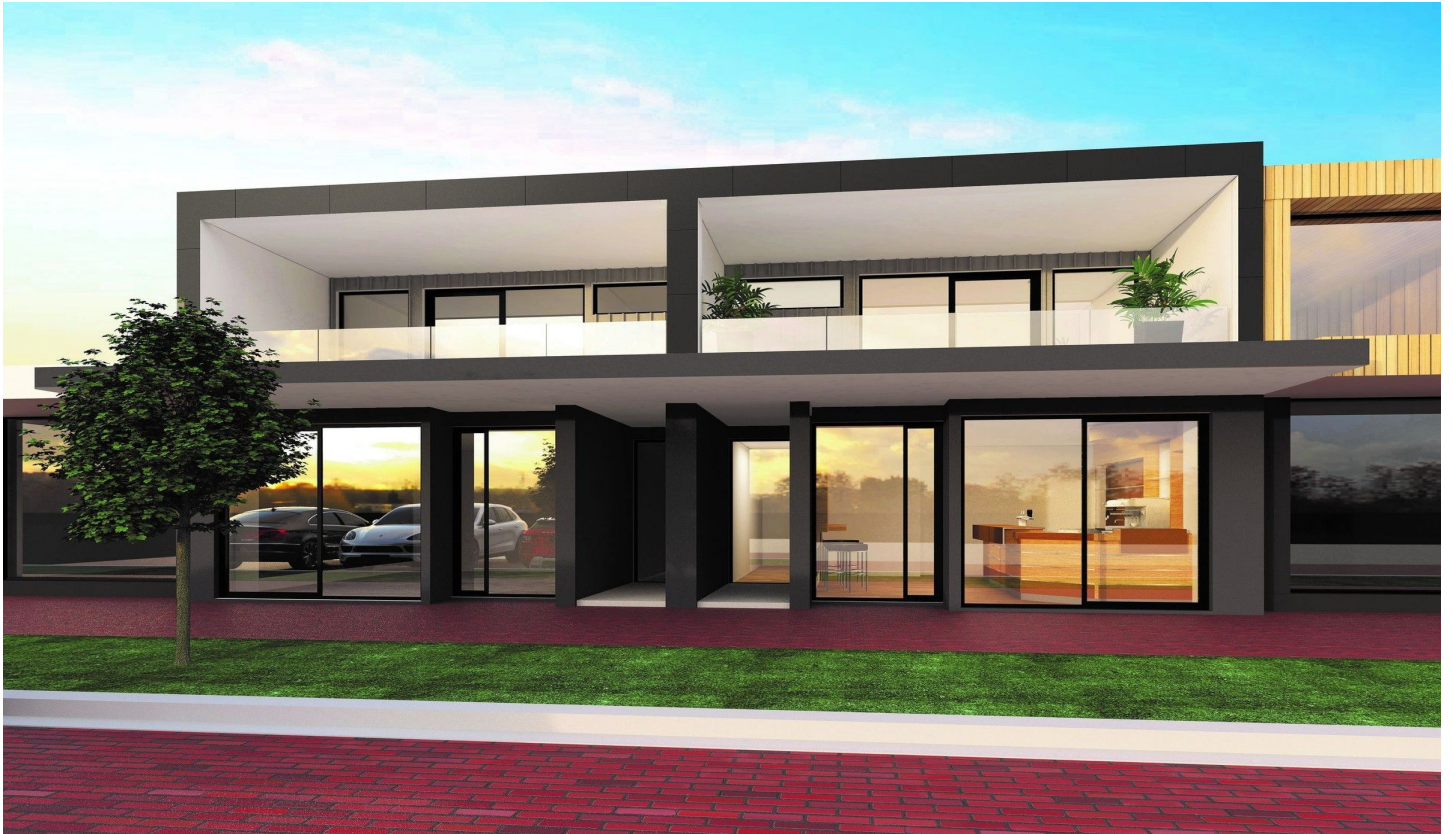
11 & 13 Guest Street, Tootgarook