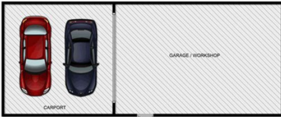
GARAGE AND CARPORT