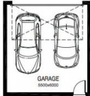
(not shown in position)