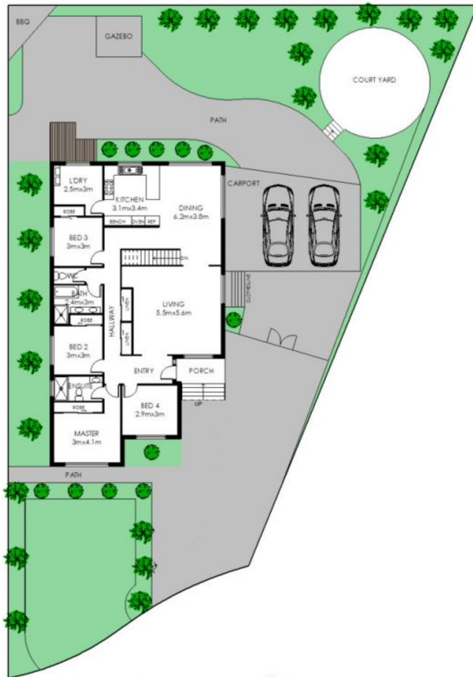
5 COOK PLACE, WESTMEADOWS