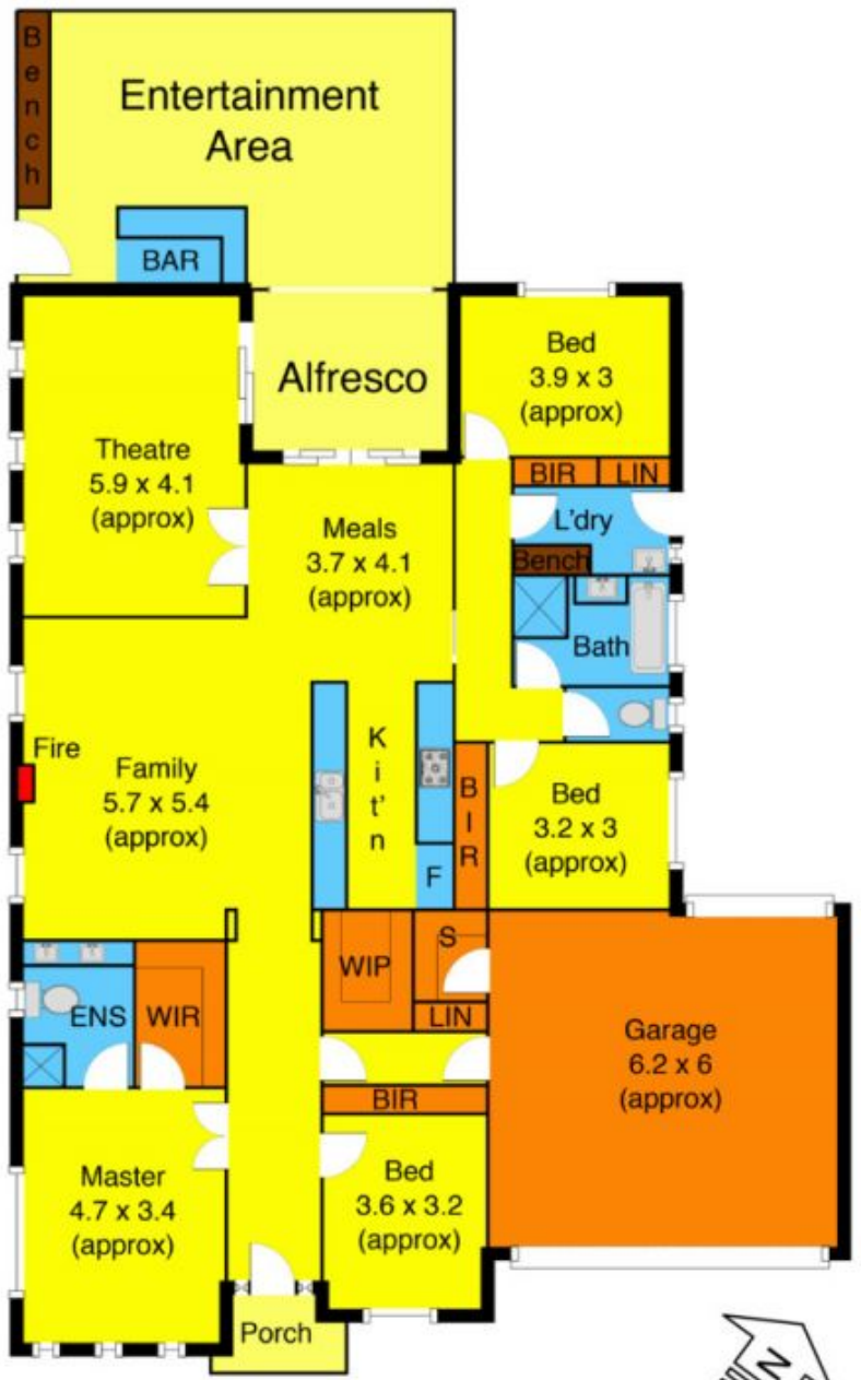
Desert Gum Way