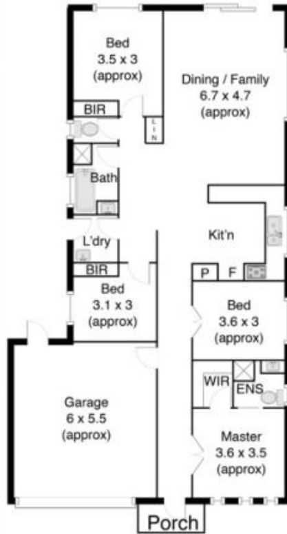
38 Coo롱up Crescent Melton W