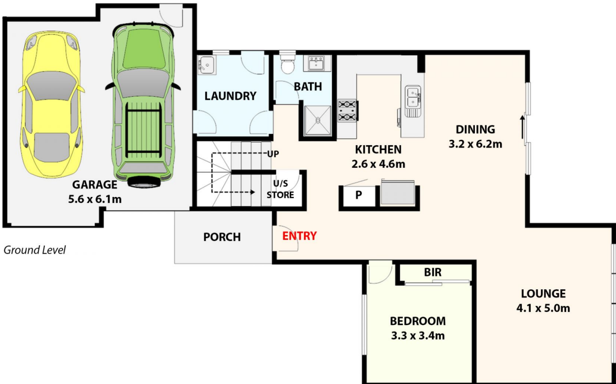
3/5 Stratheden Court, Sydenham. All data and dimensions shown in this sketch are approximate.