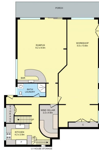
BELOW GROUND FLOOR